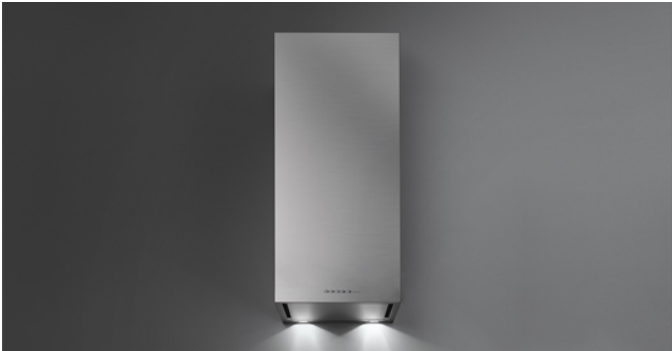
Photograph is for information purposes only May not correspond to the selected version