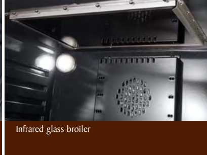
Infrared glass broiler