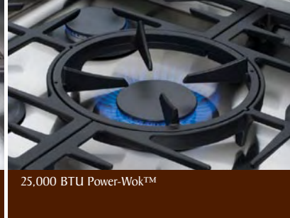
25,000 BTU Power-Wok™