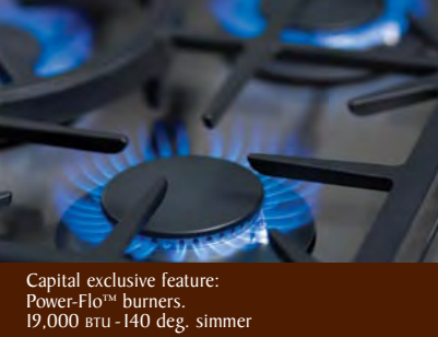
Capital exclusive feature: Power-Flo™ burners. 19,000 BTU - 140 deg. simmer