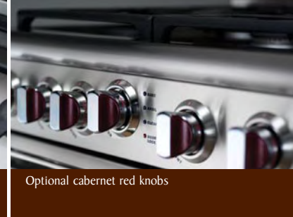
Optional cabinet red knobs